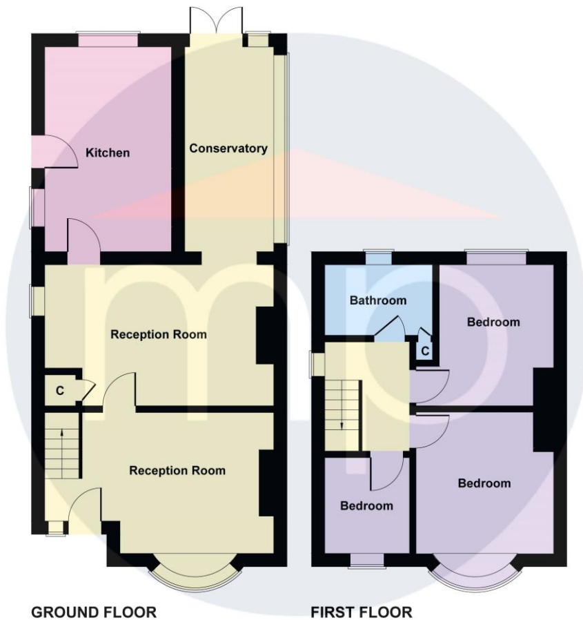
Not to Scale. Produced by The Plan Portal 2023 For Illustrative Purposes Only.

The information provided about this property does not constitute or form part of an offer or contract, nor may it be regarded as representations. All interested parties must verify accuracy and your solicitor must verify tenure and lease information, fixtures and fittings and, where the property has been recently constructed, extended or converted, that planning/building regulation consents are in place. All dimensions are approximate and quoted for guidance only, as are floor plans which are not to scale, and their accuracy cannot be confirmed. Reference to appliances and/or services does not imply that they are necessarily in working order or fit for the purpose. We offer our clients an optional conveyancing service, through panel conveyancing firms, via MWU and we receive on average a referral fee of one hundred and thirty pounds, only on completion of the sale. If you do use this service, the referral fee is included within the amount that you will be quoted by our suppliers. All quotes will also provide details of referral fees payable.